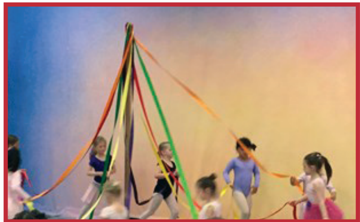
Minnesota Ballet Scenic Drop