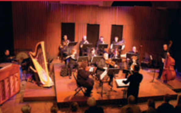
Duluth Superior Symphony Orchestra Chamber Music Concert Series