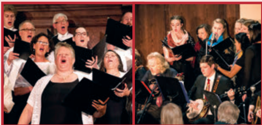
Arrowhead Chorale & Monroe Crossing

NONPROFIT ORG U.S. POSTAGE PAID DULUTH, MN PERMIT NO. 1003