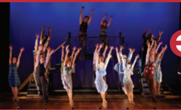
42 nd Street — Duluth Playhouse