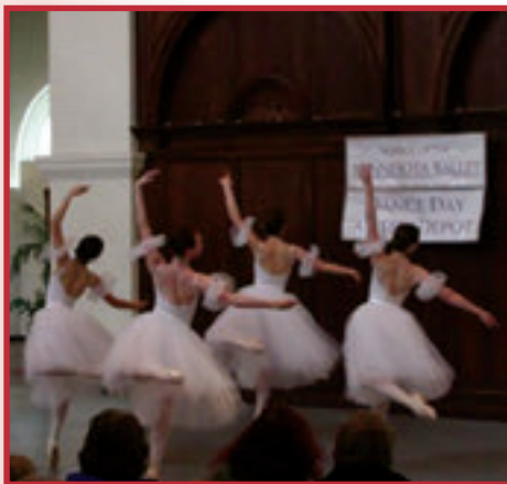
Minnesota Ballet 2016 Dance Day at the Depot